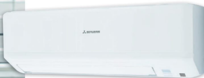
SRK25ZSP-W, SRK35ZSP-W, SRK45ZSP-W